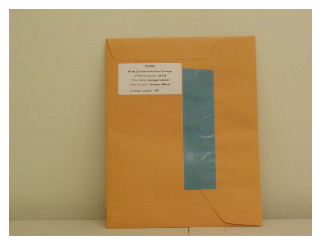
Figure 4-3: Sample Clinic Randomization Envelope